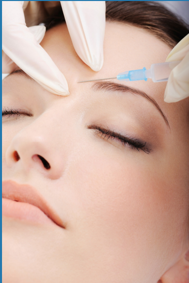
Dysport®: The New Botox® Alternative