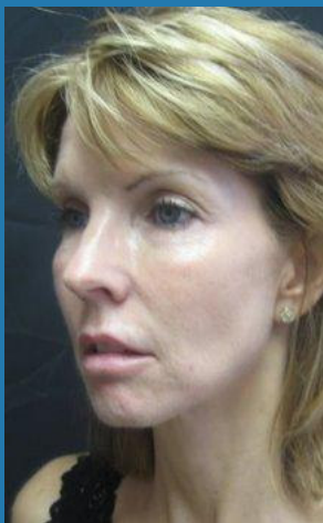
Before and After photos of a patient who had undergone a liquid laser facelift procedure