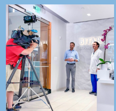
The Bitar Institute featured on WUSA 9's Good Morning Washington