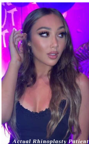
Actual Rhinoplasty Patient