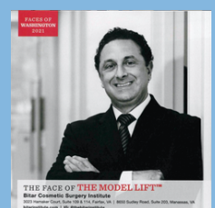
Bitar Institute featured as the face of the Model Lift™ in Washingtonian Magazine