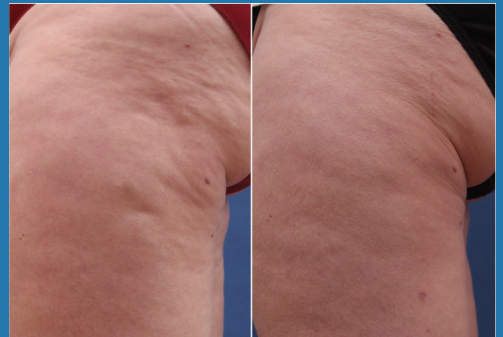
CelluSmooth Results Photos Courtesy of Sciton Inc.