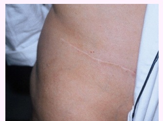
Photos showing the application of the tape and cream system on a tummy tuck scar. The last photo is the tummy tuck scar one year after surgery.