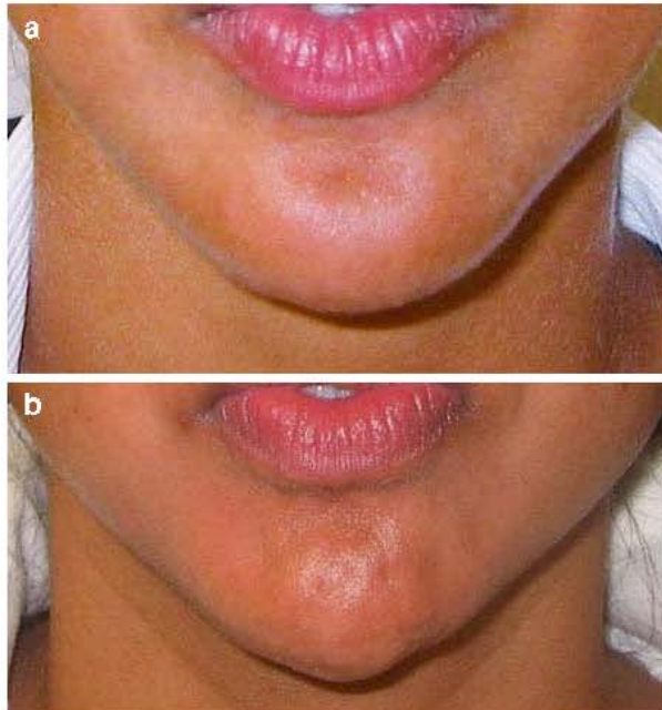
Fig. 21.5 Mentalis (dimpled chin) treatment with Botox® Cosmetic. (a) Pretreatment. (b) Posttreatment

Another emerging trend is the use of botulinum toxin for masseter reduction in treating facial widening [9]. According to the ASPS, clinicians who treat this area use anywhere from 10–50 U of Botox® Cosmetic per side; however, 25–30 U per side is generally recommended [8]. In treating facial widening with botulinum toxin, the underlying cause should be the masseter muscles and not mandibular bony prominence [9].