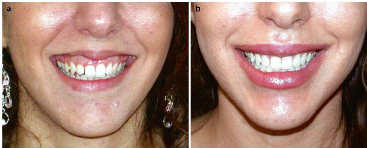
Fig. 21.6 Excessive gingival display (gummy smile) treatment with Botox® Cosmetic. (a) Pretreatment. (b) Posttreatment