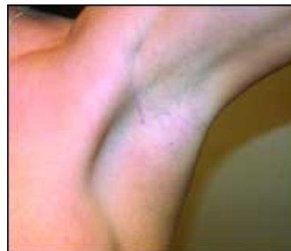
Figure 1. The marked area of the axilla is where the incision is made (left), leaving a virtually imperceptible scar (right).

After the patient has been anesthetized and intubated, the breasts are infiltrated with tumescent solution (in a fashion similar to that used for liposuction). The injection technique is important to the achievement of hydrodissection in the submuscular plane and vasoconstriction of the area to be dissected.