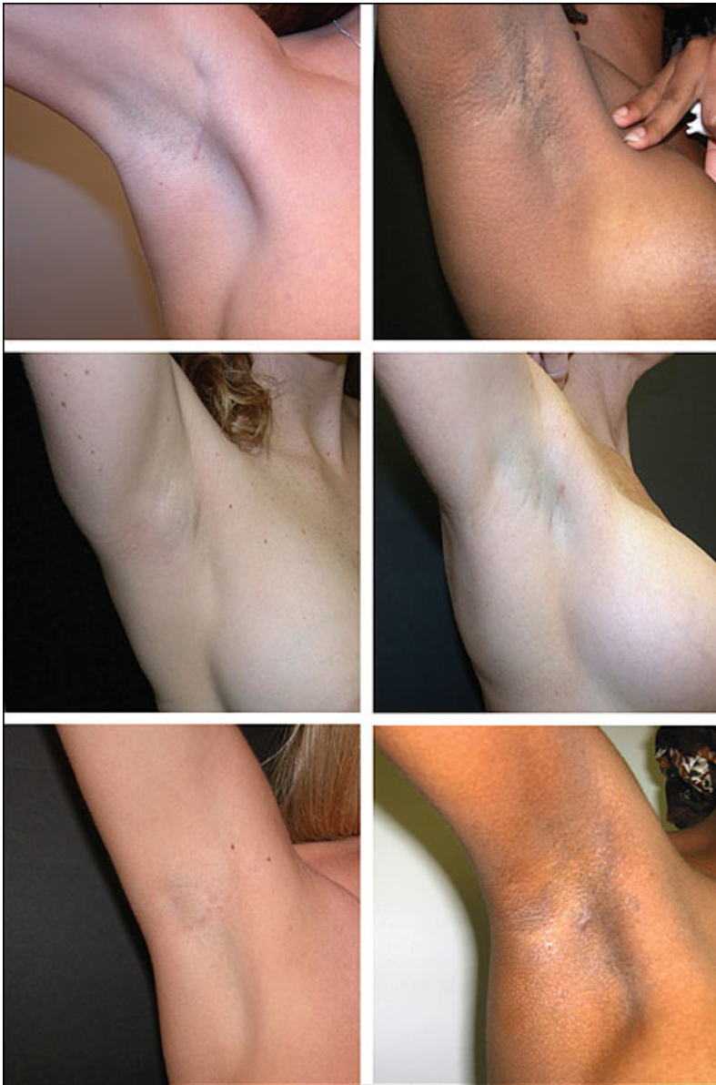
Figure 3. Axillary scars in women of various skin colors.

natural, making the argument that silicone implants feel more natural an invalid reason for having silicone implants.